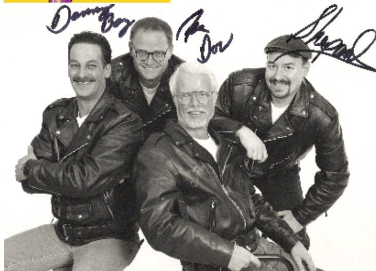
The Fabulous Fourmel'dyhides Return for Omaha Engagement

Jesus Christ Superstar - June 1, 2007 8:00 PM-$72