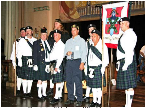
Gurthrie Oklahoma KSA Members