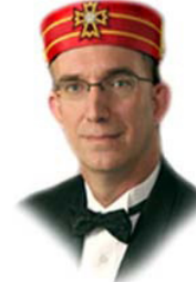
Venerable Master of Kadosh Omaha Consistory