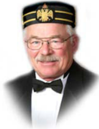
Eminent Commander, Council of Kadosh