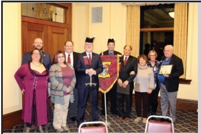
Newly knighted members of the Omaha Valley KSA

The Table Lodge is always a fun tradition, whether a formal setting or informal as was the case at the Scottish Rite, and the Brethren enjoy a relaxing occasion to get together and enjoy a few drinks and fellowship.