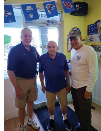
A fellow can get used to shorts in January!

Greetings from St. Petersburg, Florida! The weather is warm, the roads are clear, the water is blue and the scenery is beautiful. I have been on a much-needed vacation for the better part of the past month, and it has been fun to catch up with friends I haven't seen in more than 35 years! I have to admit the Valley has been on auto-pilot in my absence.