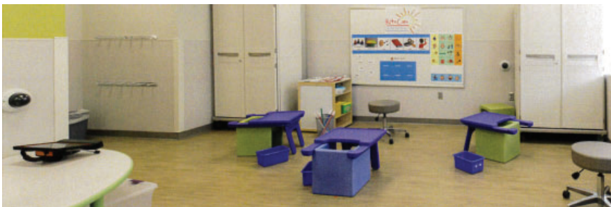
View of the RiteCare Clinic preschool at MMI