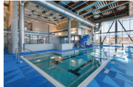
The new recreation therapy pool

In addition to the RiteCare Clinic, the new MMI building includes cold and warm-water pools, an indoor splash pad, state-of-the-art physical therapy and virtual reality labs. Simulated apartment spaces will help young people with intellectual and developmental disabilities learn to live independently.