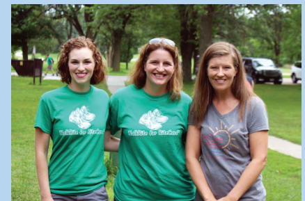
Fifty RiteCare family members as well as Scottish Rite Masons joined the Walk for RiteCare on July 17th at Pioneer Park to support pediatric speech services.