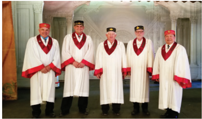
Brethren from Long Pine Lodge #136