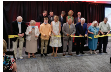
Cutting the ribbon at Munroe-Meyer Institute

Nebraska's Scottish Rite Masons have made a 5-year commitment, pledging