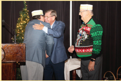
Announcing the scholarships at the Christmas banquet, December 2021