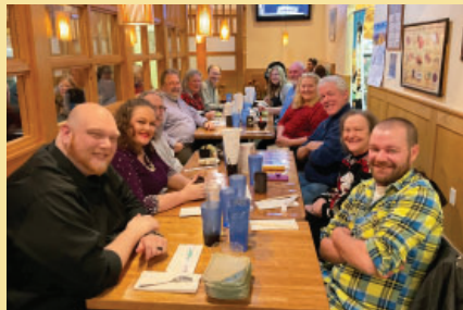
Family members and Brethren of Centennial Lodge #326 went to Sakura Bana, followed by seeing A Christmas Carol together at the Omaha Community Playhouse

They want a concrete value statement to define the purpose and direction of Freemasonry. They want measurable short and long-term goals to provide a sense of whether they are achieving those objectives. They want to see definitive deliverables offered by their membership: networking, community engagement or volunteering, education, social outlets for families.