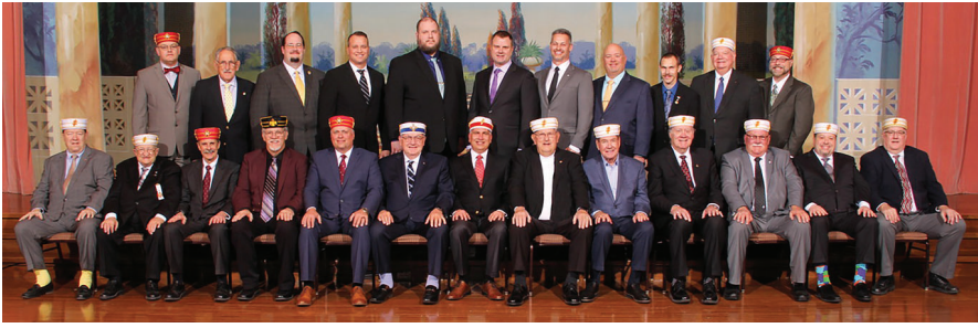
Fall, 2021 Reunion