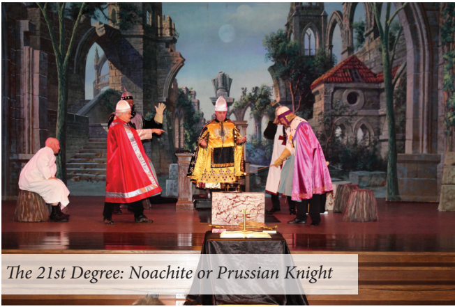
The 21st Degree: Noachite or Prussian Knight

The Valley of Omaha welcomed eight new 32° Scottish Rite Masons to the Scottish Rite on May 5, 6, and 7th at the Spring 2022 Reunion.