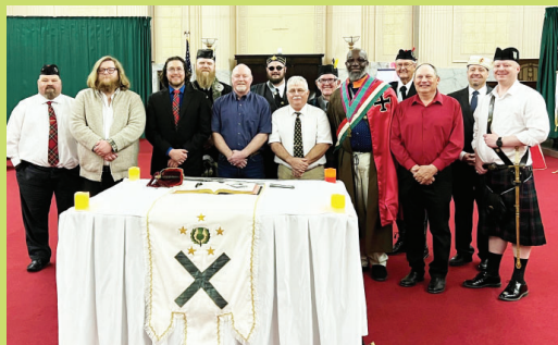
Spring 2023 Class members and the Knights of St. Andrew after the 29°