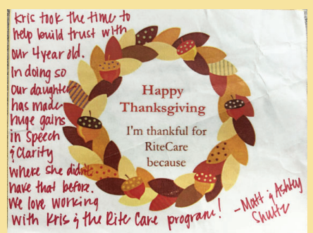
Thank you note from a RiteCare family

I ask you to consider a gift to the Nebraska Foundation as a member of the 101 Club, representing a session of therapy. Donations of $300 or more will be recognized in the Scottish Rite Journal as SGIG Circle members. All donors of $100 or more will receive the 101-Club pin, and I would ask you to wear it with pride and explain the significance to your Brethren at Lodge, your family, and your friends.