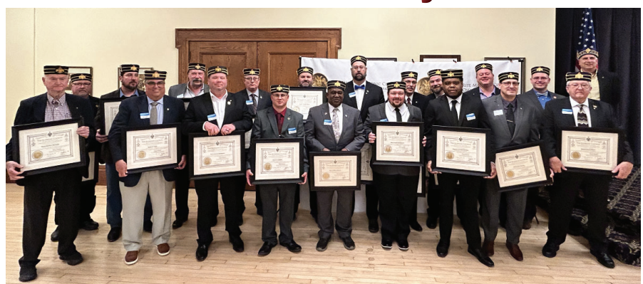
19 Brethren got their 32° Caps and Patents at the February Dinner