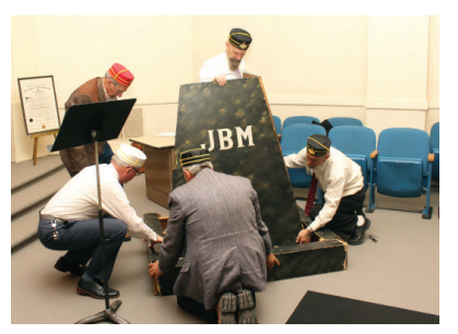
I appreciate all the Brethren who pitch in at Reunions and events!

I hope to have Candidates for a Fall Reunion, and I'll get the word out when a date has been decided upon. Please make time for Reunions when you can. We always need help with the stage crew and with Degree work. And of course, we