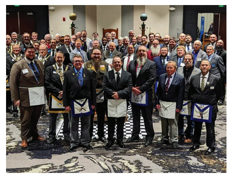
Annual Communication at the Younes Conference Center, Kearney, Nebraska

Masons often get frustrated with the mechanics of Freemasonry, arcane procedures and occasional bureaucracy, Brothers who resist change (or are pushing for change). But for me, Annual